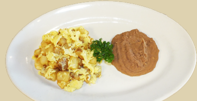
PAPAS CON HUEVOS

MIGAS $12.25 Two scrambled eggs with corn tortilla strips, pico de gallo and bacon. Served with refried beans and cubed potatoes. Add sour cream for $2.00