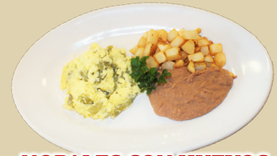
NOPALES CON HUEVOS

NOPALES CON HUEVOS $11.99 Cactus with scrambled eggs. Served with refried beans, and potato cubes. Add sour cream for $2.00