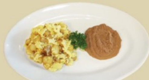
PAPAS CON HUEVOS

Two scrambled eggs with corn tortilla strips, pico de gallo and bacon. Served with refried beans and cubed potatoes. Add sour cream for $2.00