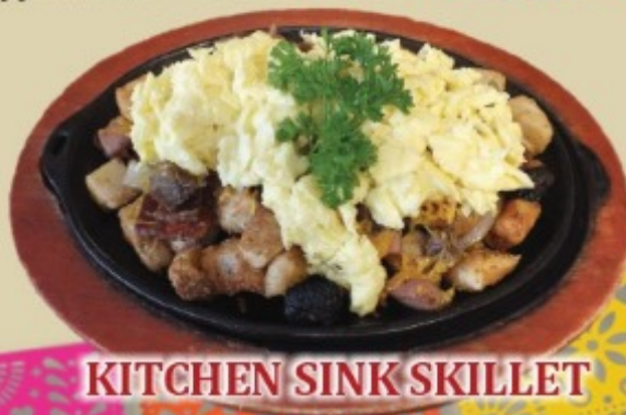
KITCHEN SINK SKILLET