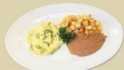
NOPALES CON HUEVOS

Cactus with scrambled eggs. Served with refried beans, and potato cubes. Add sour cream for $2.00